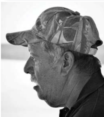
04 - Fisherman.jpg