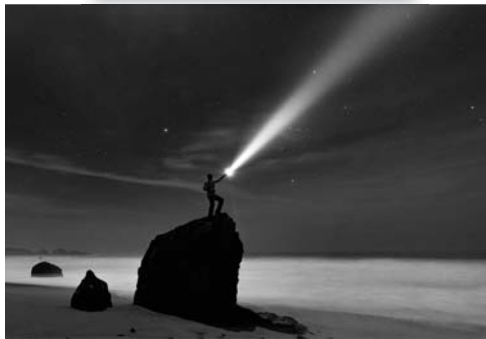
02 - Beam Me Up .jpg