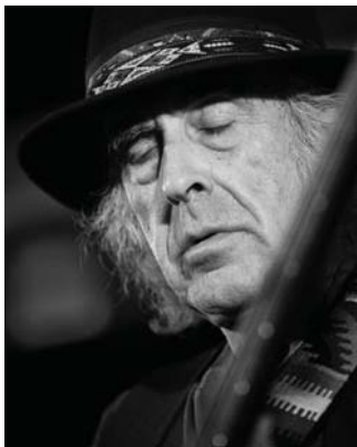
01 - Bass Player Trance.jpg